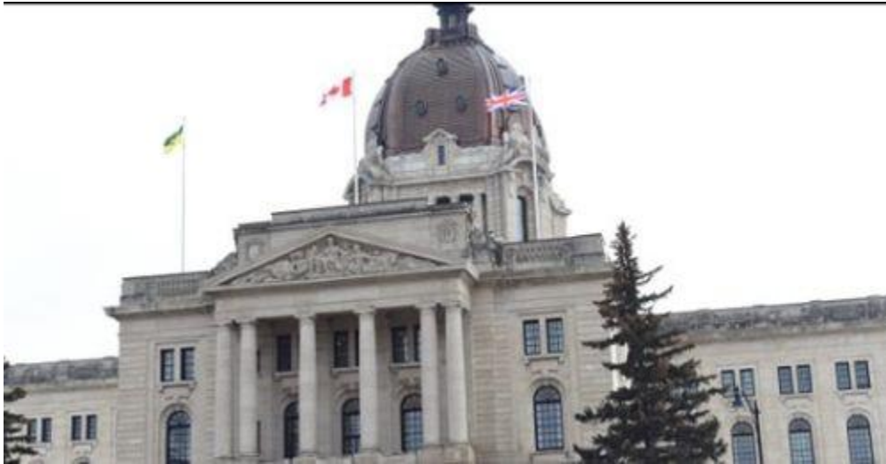
Report from the Legislature

The Speech from the Throne officially launched the Fall Sitting of the Legislature and has charted a course that ensures sustainable growth that works for everyone. That plan was constructed from your feedback over the summer months, focusing on health care, the economy, affordability, and defining future opportunities.